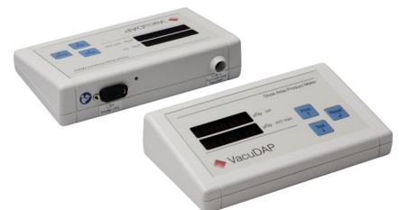
Display Bluetooth ®